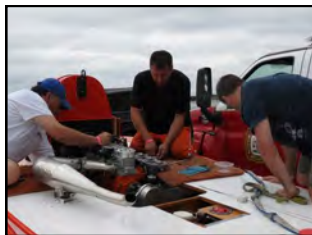
Teamwork looking for gremlins.