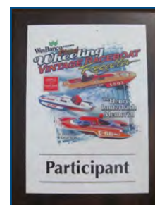
Participant plaque from the Wheeling Vintage Raceboat Regatta