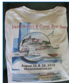
A T Shirt from the Toledo Boat Show