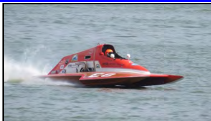
The APBA Driving School Boat had a lot of visibility at Celina.

Several past boat racers were seen at the Celina race. Does everyone recognize this guy?