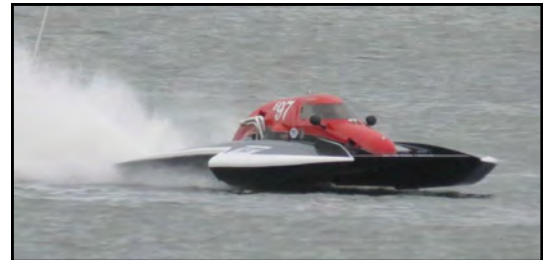
Todd Liddycoat racing down the straightaway.