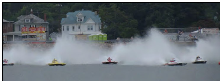
The Y class was well represented in Hampton.