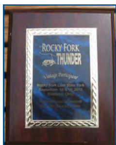
Rocky Fork Thunder participant plaque