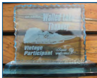
Lucite award from Walled Lake Thunder