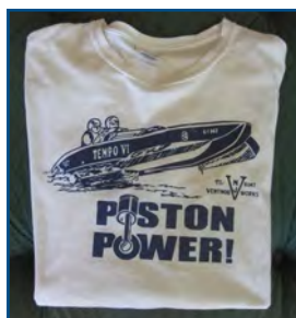
A neat T Shirt from the Buffalo Launch Club Vintage Regatta

But – there is swag , those participant goodies you get at the racing venues, the regattas and the boat shows. Here's a sample of those rewards that thank vintage folk for participating in the show. All in all, they are pretty neat, and look good when displayed on the mantle, in the workshop, or at one's workplace. In the middle of a cold winter, they do bring a ray of remembered fun from the past season, and in some ways symbolize the joy associated with this niche sport.