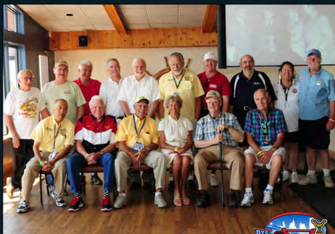
Detroit, Michigan 2014