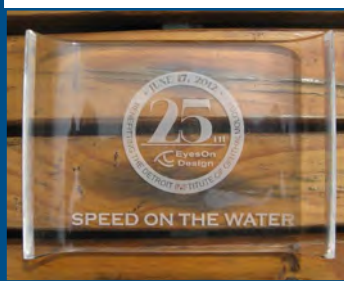
Lucite award from the Eyes on Design Boat and Car Show