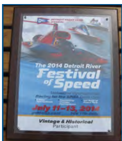
APBA Gold Cup participant plaque