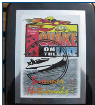
The Quake's vintage "thank you" award