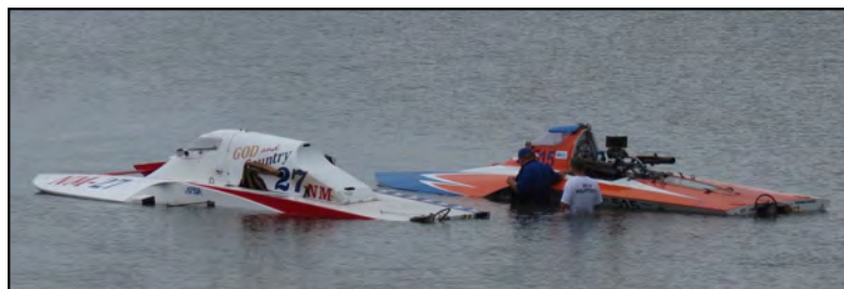
The One Way waiting for the start.