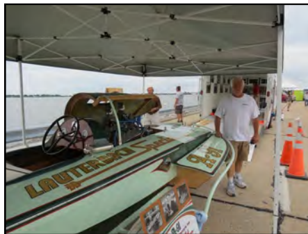
The Lauterbach Special with engine rebuilt by Rich Willim.