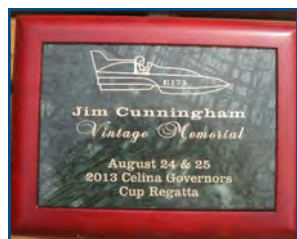
Embossed wood jewelry / trinket case from the Celina Regatta