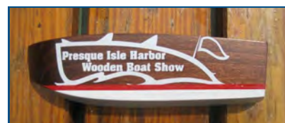
Hand carved half hull from the Presque Isle Boat Show