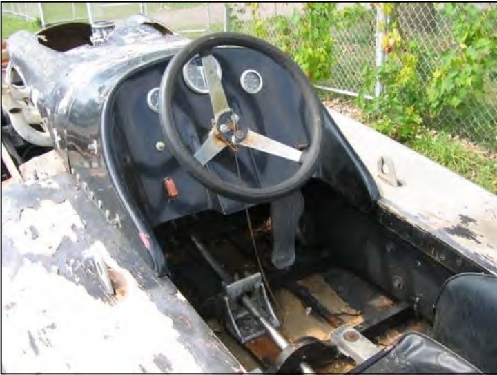
The mechanicals as seen in the boat's cockpit all seemed to be there. She hadn't been cannibalized when stored. A good sign.