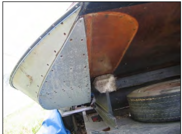
The aluminum cladding on the sponson was in place. Looks like there might be patch or modification on the bottom.