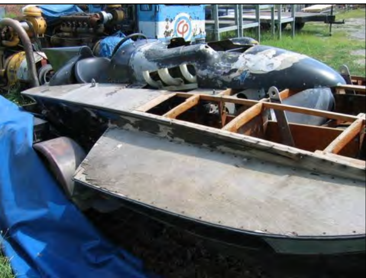
The cowling has been butchered and half the deck gone. Not the best of signs.