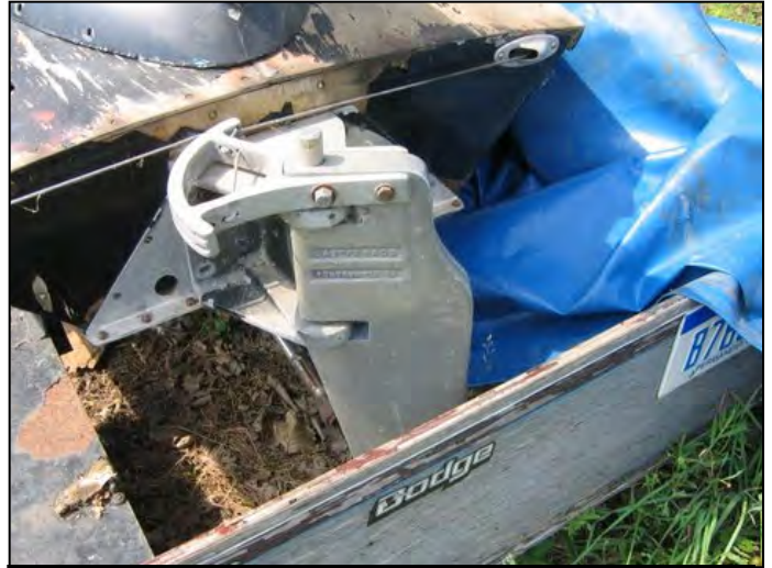
The name Lauterbach is cast in the rudder, but the boat itself does not call out Lauterbach design and construction.