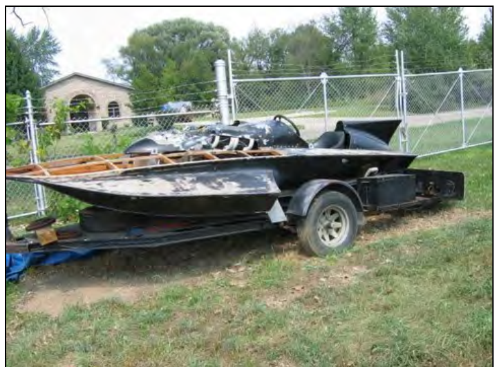
The yet-to-be -identified hydro as found next to the fence in a shop's back lot. I just removed the tarp.

I drove up to Wolf Lake and met with Erik at a small factory in the area. Covered with a canvas, the boat was now sitting on an old trailer in a yard behind the factory. As soon as I saw the canvas, I knew there wasn't a Lloyd 135 underneath it. We uncovered the boat – but I was stumped as to what make it was. I knew it was a 280 because you could see E6_ _ faintly bleached into the top of a sponson. But, I couldn't identify the builder of the boat. It looked like a Lauterbach , but it had Farmer influences. I took a dozen or so pictures of the boat, and considered buying it if the price was right. Erik and I wheeled and dealt our way to a price I was sort of willing to pay, an amount he seemed willing to accept.