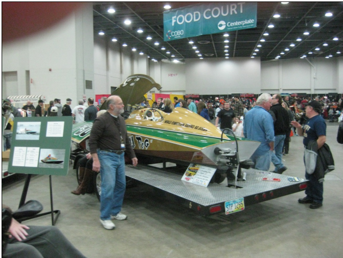
Name the three guys with Miss Peg .

I'd put a four barrel carb on that motor.