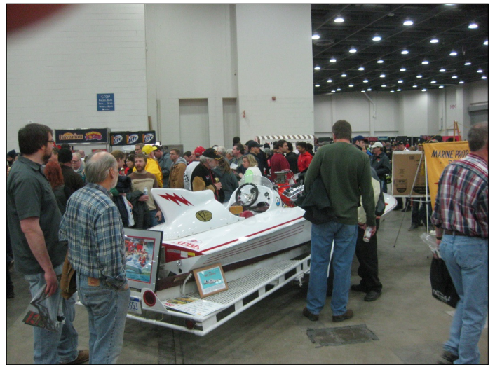
That motor is in there backwards!?