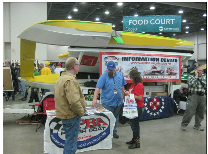
Our fearless show organizer at work.