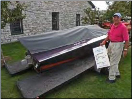
The story behind the vintage Miss Vernors