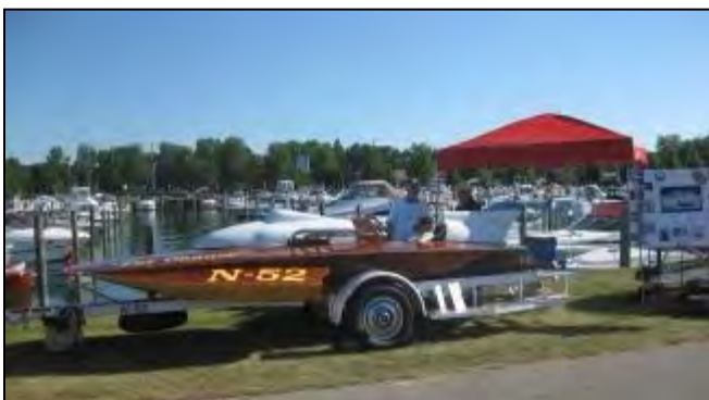
A rare view of Royce's Fat Chance