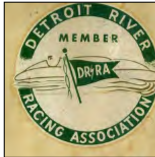
Vintage logo of the DRRA