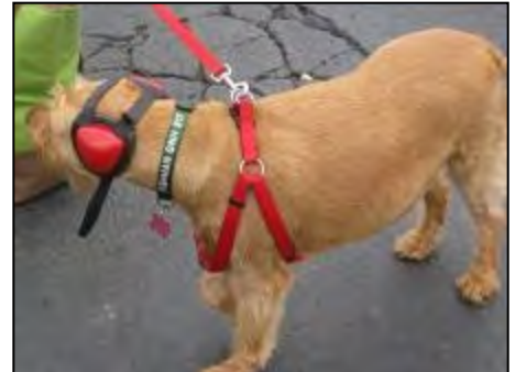
A wise spectator at many of our meets