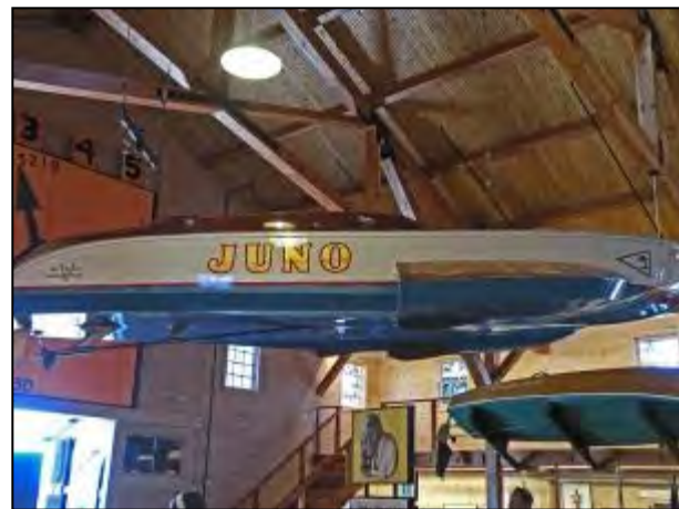
Suspended in mid-air - the museum quality Juno