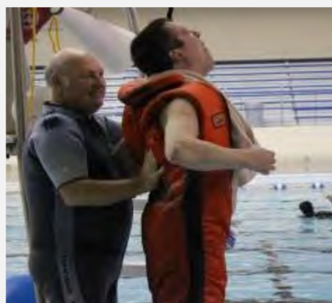
What's going on here?