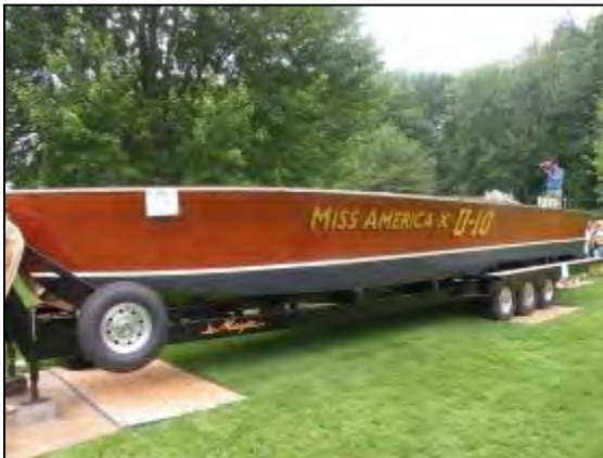
Yes, Miss America X is that long

Hope you enjoy these photos from various race sites.