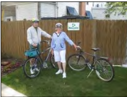
Spectators at Buffalo Launch Club following directions