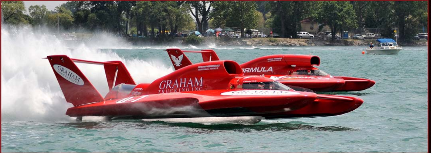
National Merit Print: GotYa!