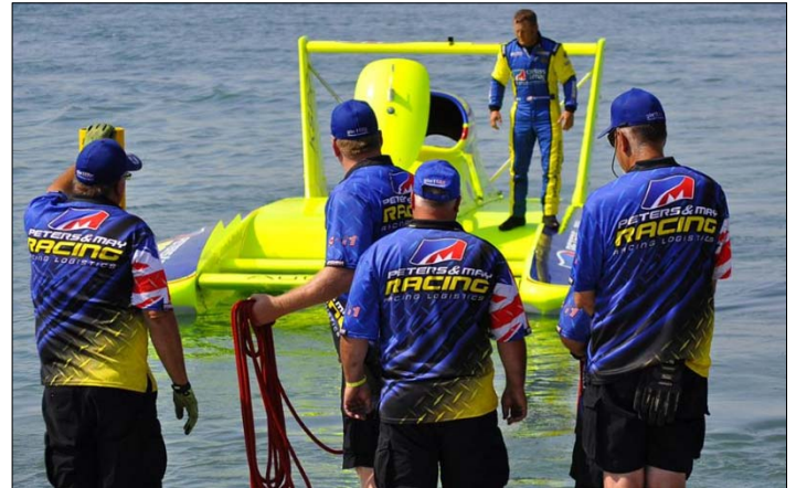
2014 Gold Cup