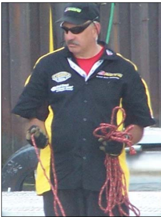
2012 Gold Cup