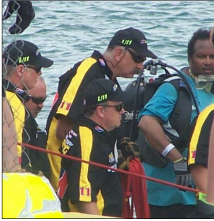
2012 Gold Cup

What are your accomplishments in boat racing? I think being recommended to be an unlimited inspector was pretty cool. I received a call out of the blue, saying I came highly recommended. To this day, I don't know who made that recommendation; I have an idea. But to whoever did that, thank you so much.