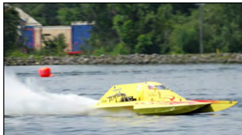
Quake on the Lake, 2013