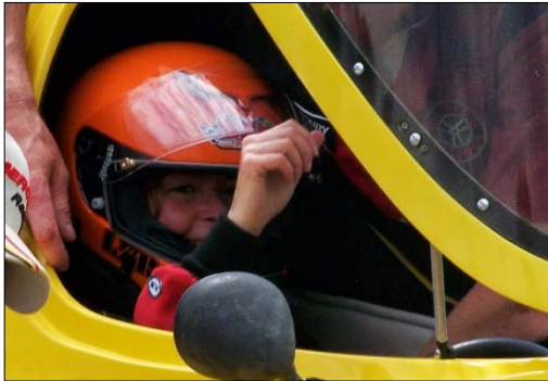
Getting strapped into the SST 120 at the first APBA driving school. Hard to tell but she has a HUGE grin.