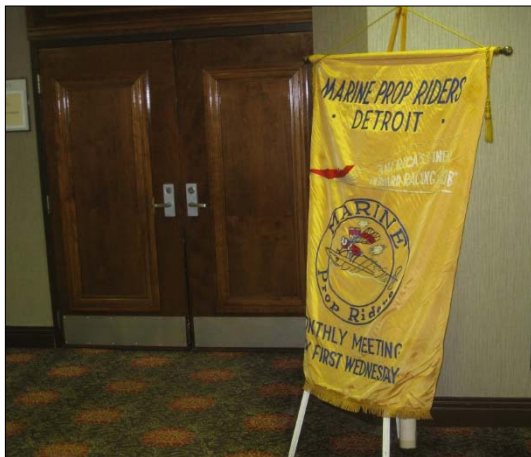
Attendees couldn't miss the impressive MPR presence at the dinner.