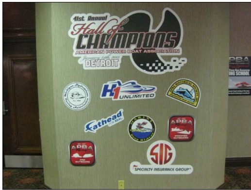
MPR's busy bee floating among the other sponsor's logos.