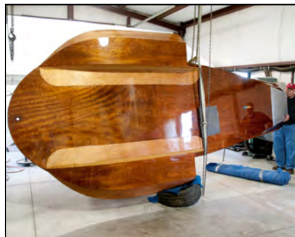
Completed bottom, ready to turn over.