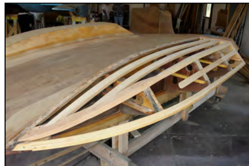
New battens installed in sponson bottoms.