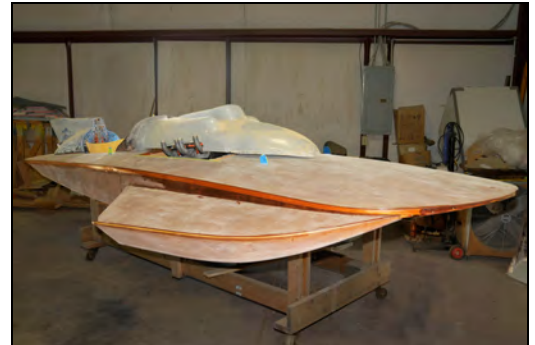
Glass sanded and ready for paint.