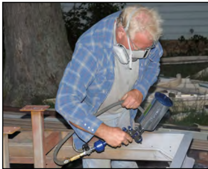
Painting the trailer in my yard.