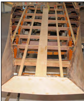
New keel, new bottom battens installed.