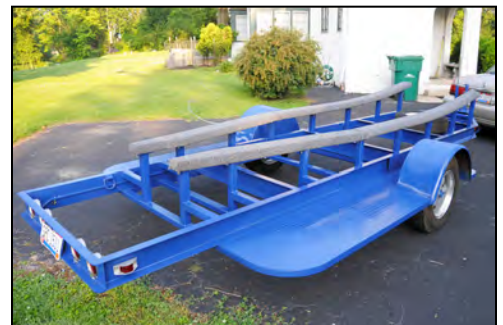
Completed trailer, ready for Helter Skelter .