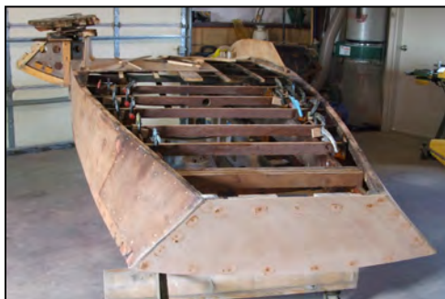
New frames, new transom, and covered sides of Helter Skelter .

“The first thing I did, as I do with all my projects, was to determine how much of the wood in the boat was re-usable. Well, not too much. It appeared that the boat was stored on an angle, bow up, so a good deal of the deterioration was in the bottom and back of the boat and in the backs of the sponsons. The front part of the boat was not as bad. So, the project became a rebuilding effort – new frames, new keel, new battens, new skin on the deck and new rear frames on the sponsons, using the old parts as patterns. The sides of the boat were fairly solid, but scarred and rough, so I covered them with an overlay of 1/8 inch plywood. The new decks are 1/4 inch Okume, covered with a layer of glass. The pictures show this process in some detail.