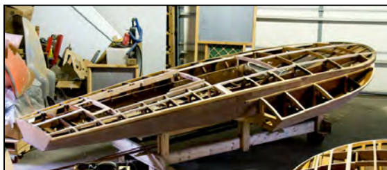
Right side up, ready for deck skin installation.