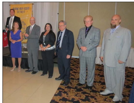
2015 MPR Board of Directors