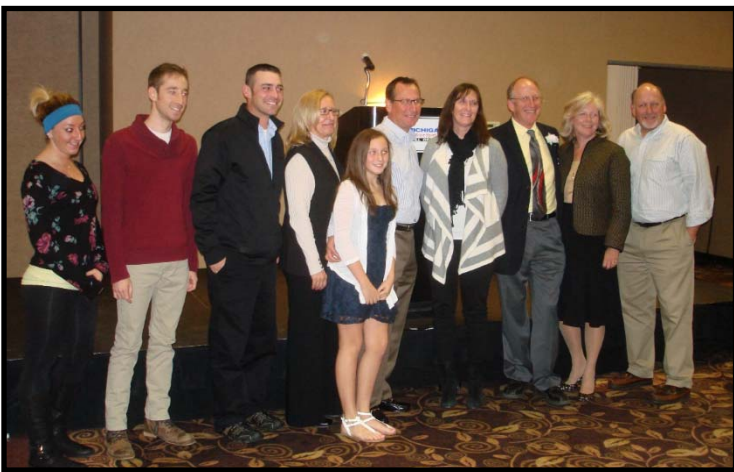
Weber Family Members